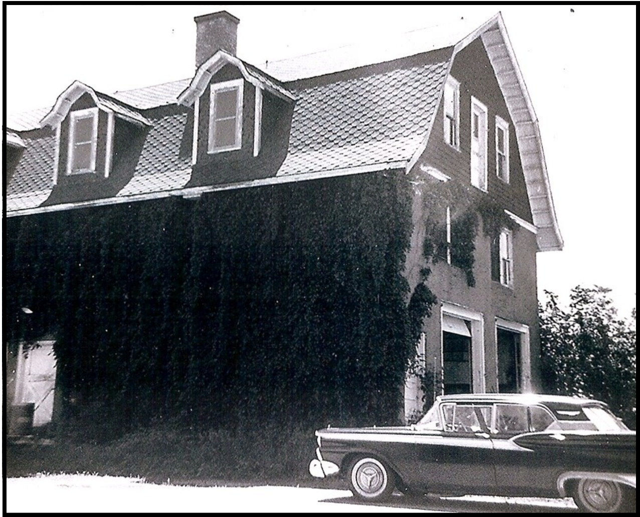
Creamery building, behind the main house. Top two floors had sort of "hotel rooms" for hired hands. The main floor consisted of the Creamery on the north end, slaughterhouse to the east and a garage and strage space to the south. (Photo ca. 1962)

Stanley Skiba, with children Tom and Ann, on Radisson Farm. Skiba purchased the 1200 acre farm from Radisson Hotel creditors and immediately sold much of its Highway 65 frontage to pay for the farm parcel.