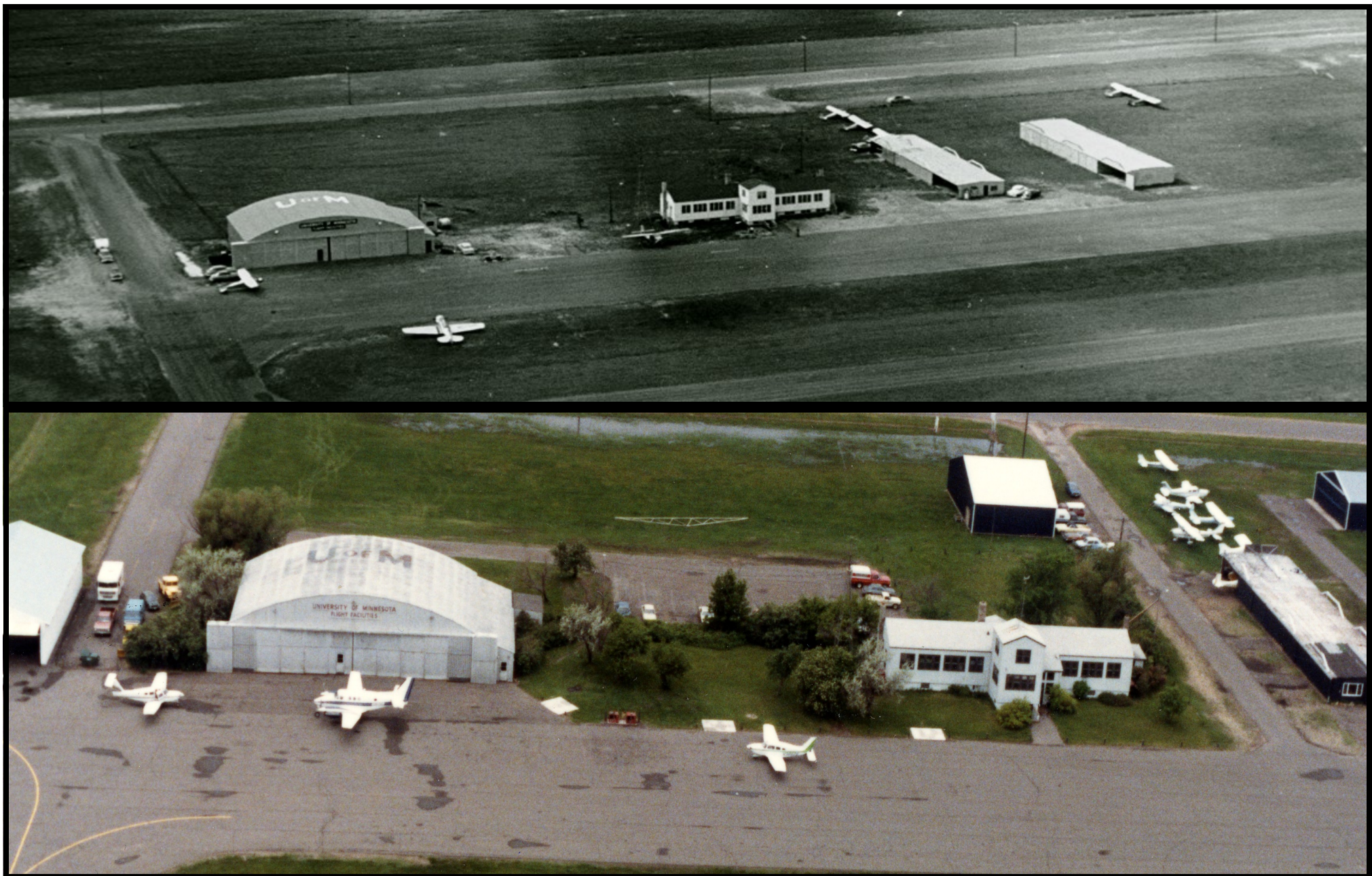
Snapshots in time (top) - Airport and surrounding area, ca. 1951 (bottom) Same area, ca. 1988