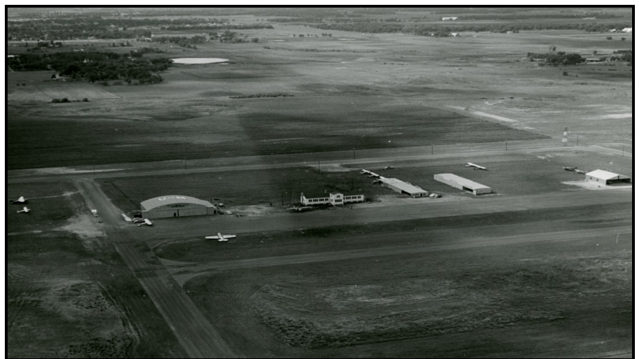
Anoka County Airport University hangar and administration building—1951