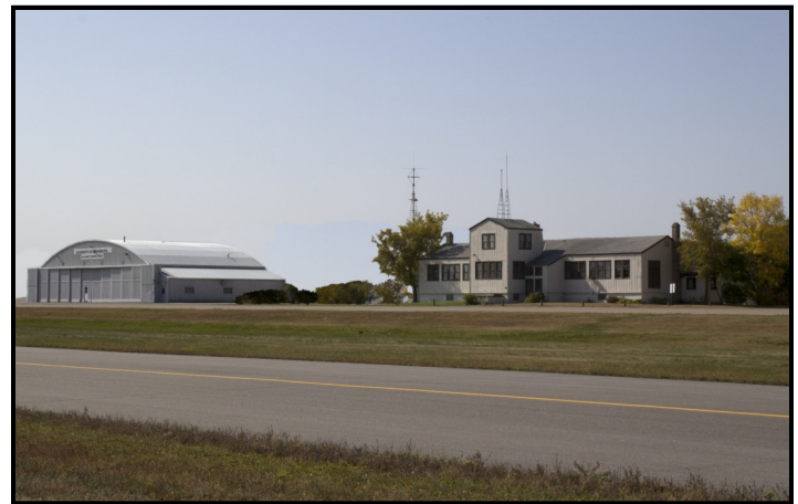
Modern view of former U of MN flight facilities (hangar at left and admin building at right)