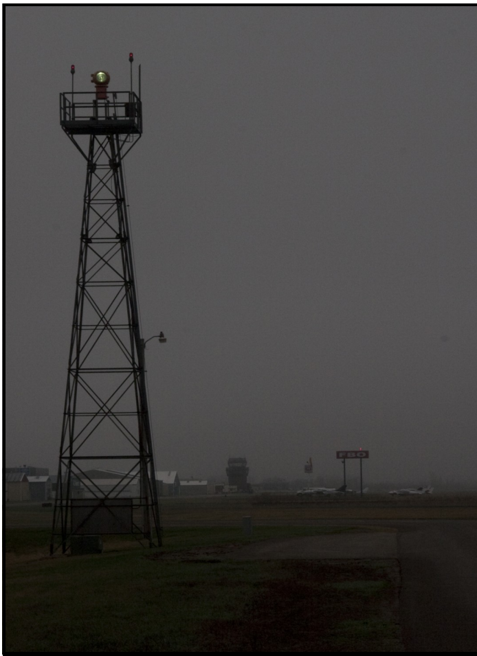
Light tower in the mist at Janes Field