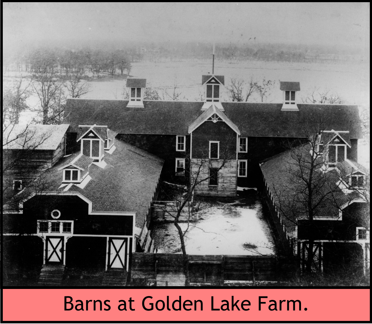
Barns at Golden Lake Farm.