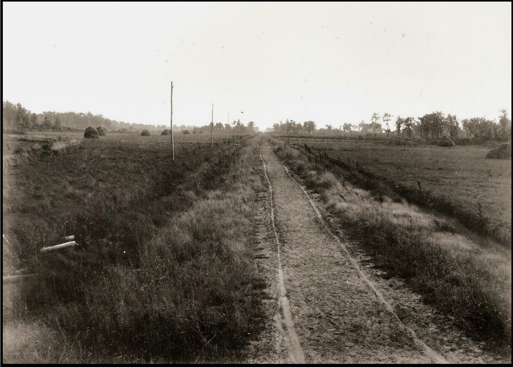
“Elwell Grade”, built between Oak Leaf and Golden Lake Stock Farms—photo circa 1892.