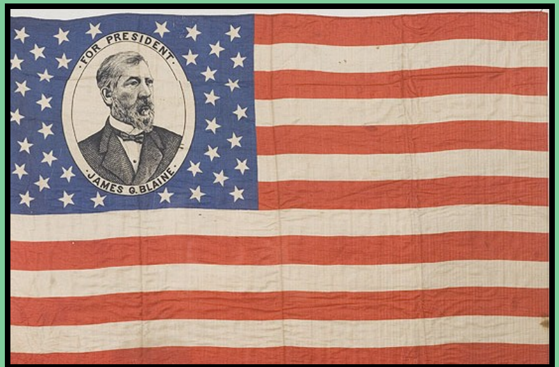
Presidential Campaign flags showing James G. Blaine