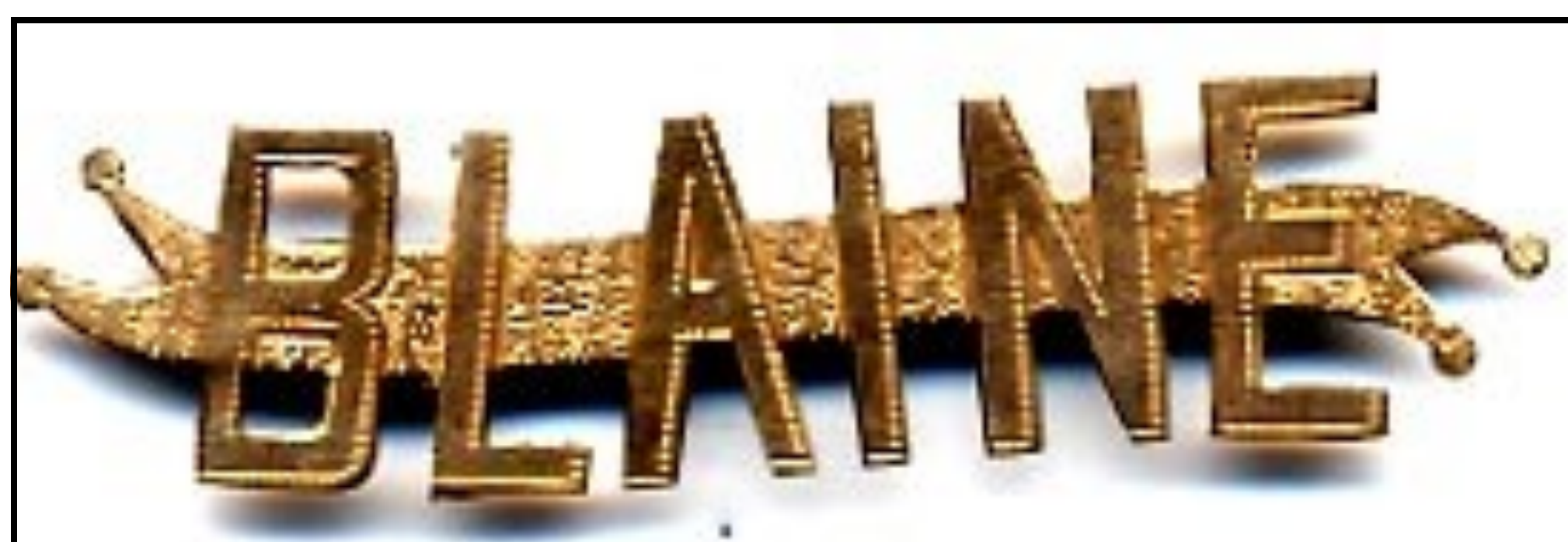
Blaine Campaign Pin